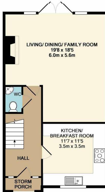
GROUND FLOOR APPROX. FLOOR AREA 789 SQ.FT. (73.3 SQ.M.)