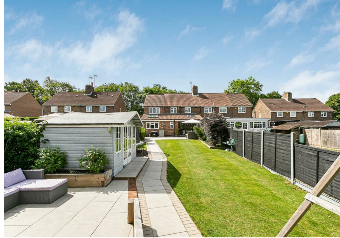
6 Wellington Cottages Ware, SG11 1EE