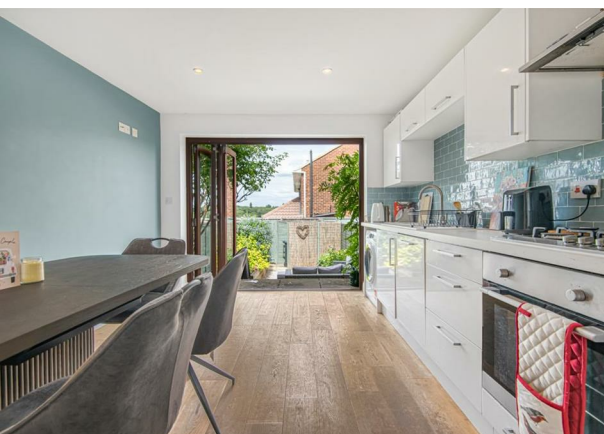
Ground Floor Approx. 36.1 sq. metres (388.9 sq. feet)